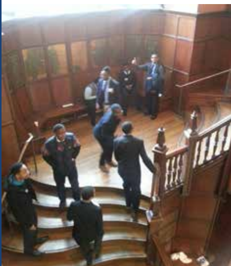
Delegates from Boys Latin High, one of 5 participating high schools