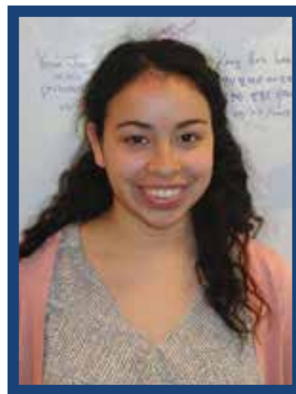
International News Picks by: Carolina Torres

http://www.un.org/apps/news/story.asp?NewsID=44555&Cr=west+africa&Cr1=#.UWbA5pPOmok bill/UPI-42191365688597/?spt=hs&or=tn