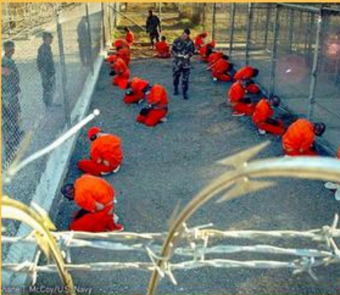
National Security Overview